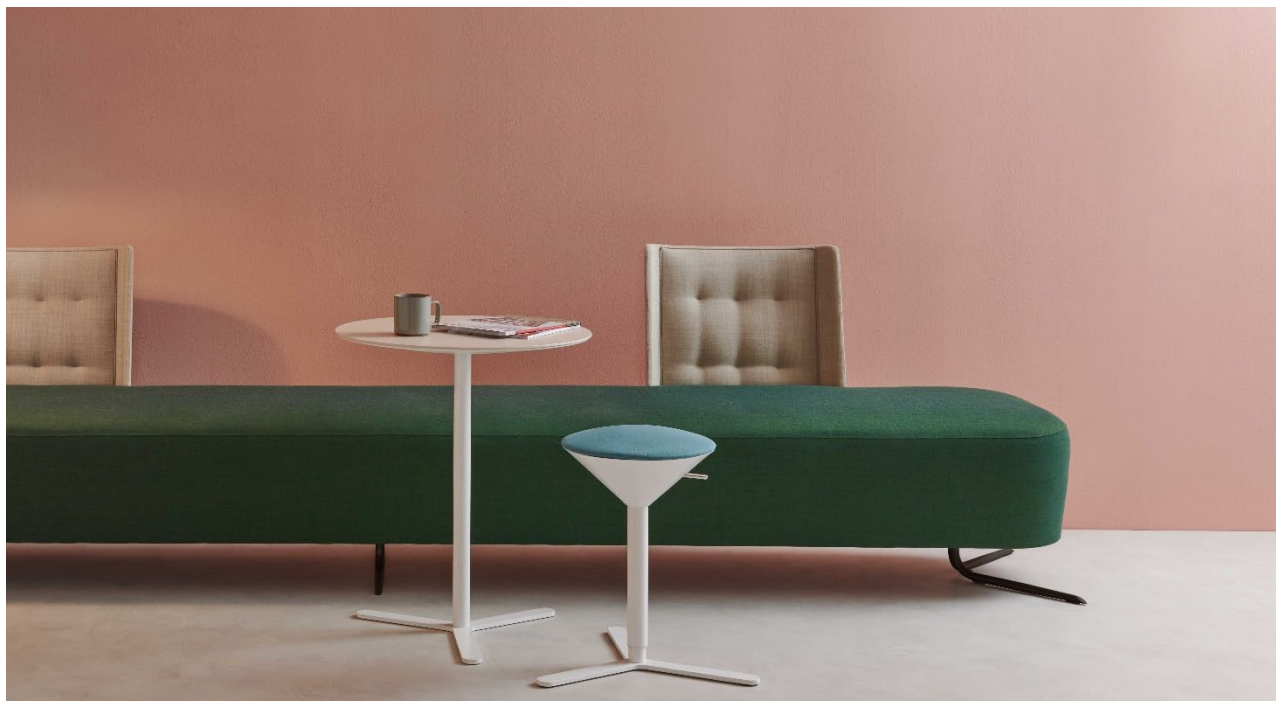
Cono, H45 (17 \frac{3}{4} ") - 65 (25 \frac{5}{8} ") stool with white snow powder coated base